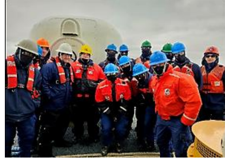
Pictured above is LEGARE'S anchor detail a group of dedicated individuals

Let's make sure it's holding! The northern seas often present exciting weather conditions and sea states.