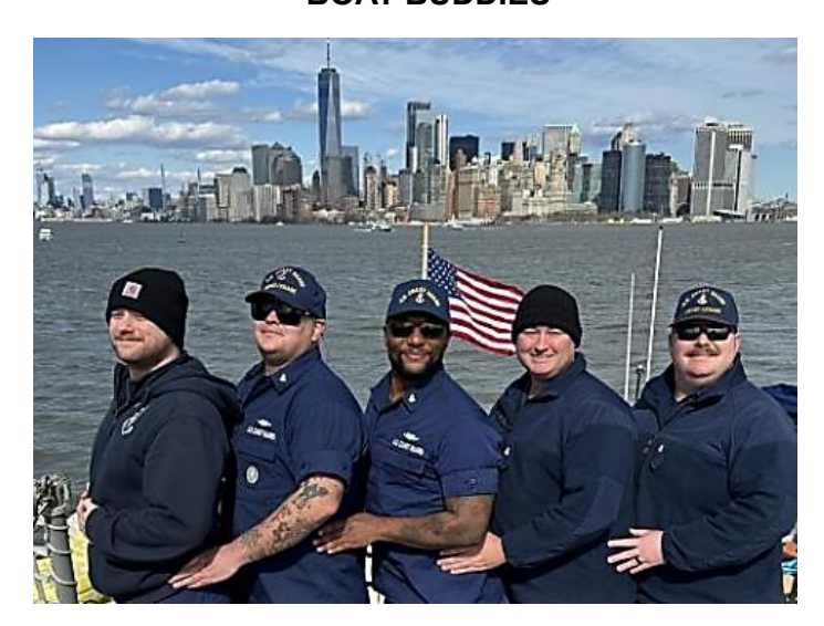
ANCHORS AWEIGH, HOMEWARD BOUND! BOAT BUDDIES