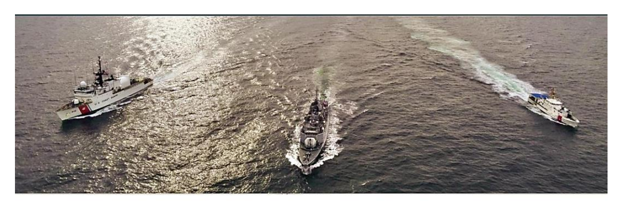
LEGARE WELCOMES THE FRENCH