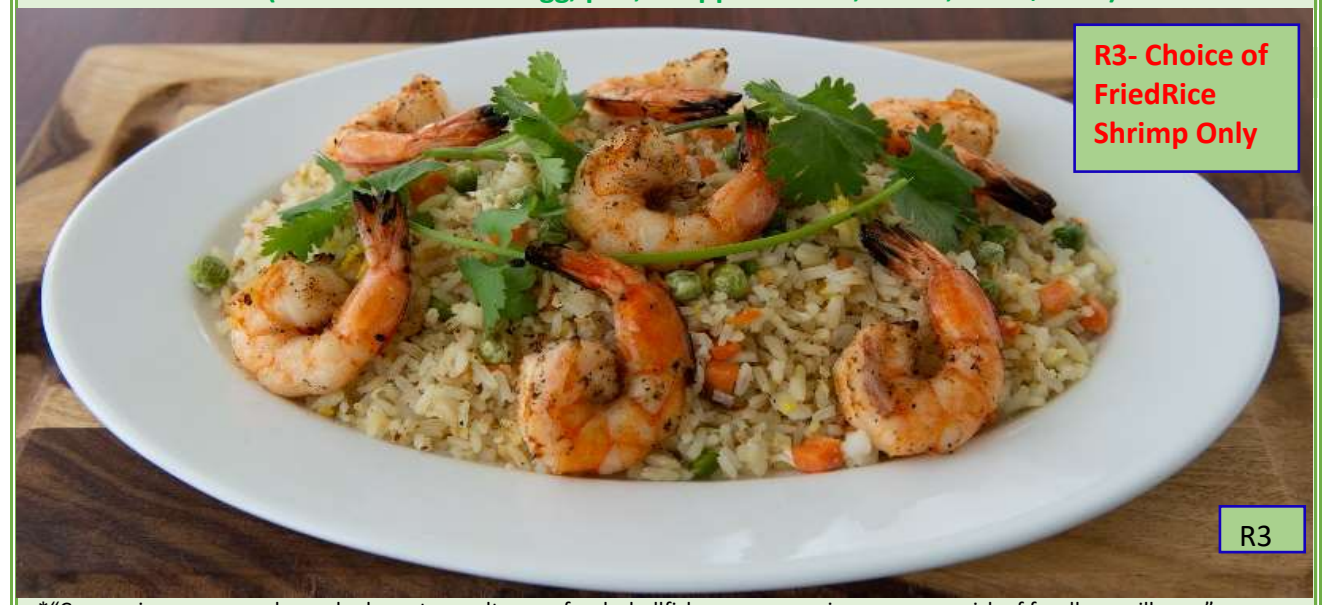
*"Consuming raw or undercooked meats, poultry, seafood, shellfish or eggs may increase your risk of foodborne illness."