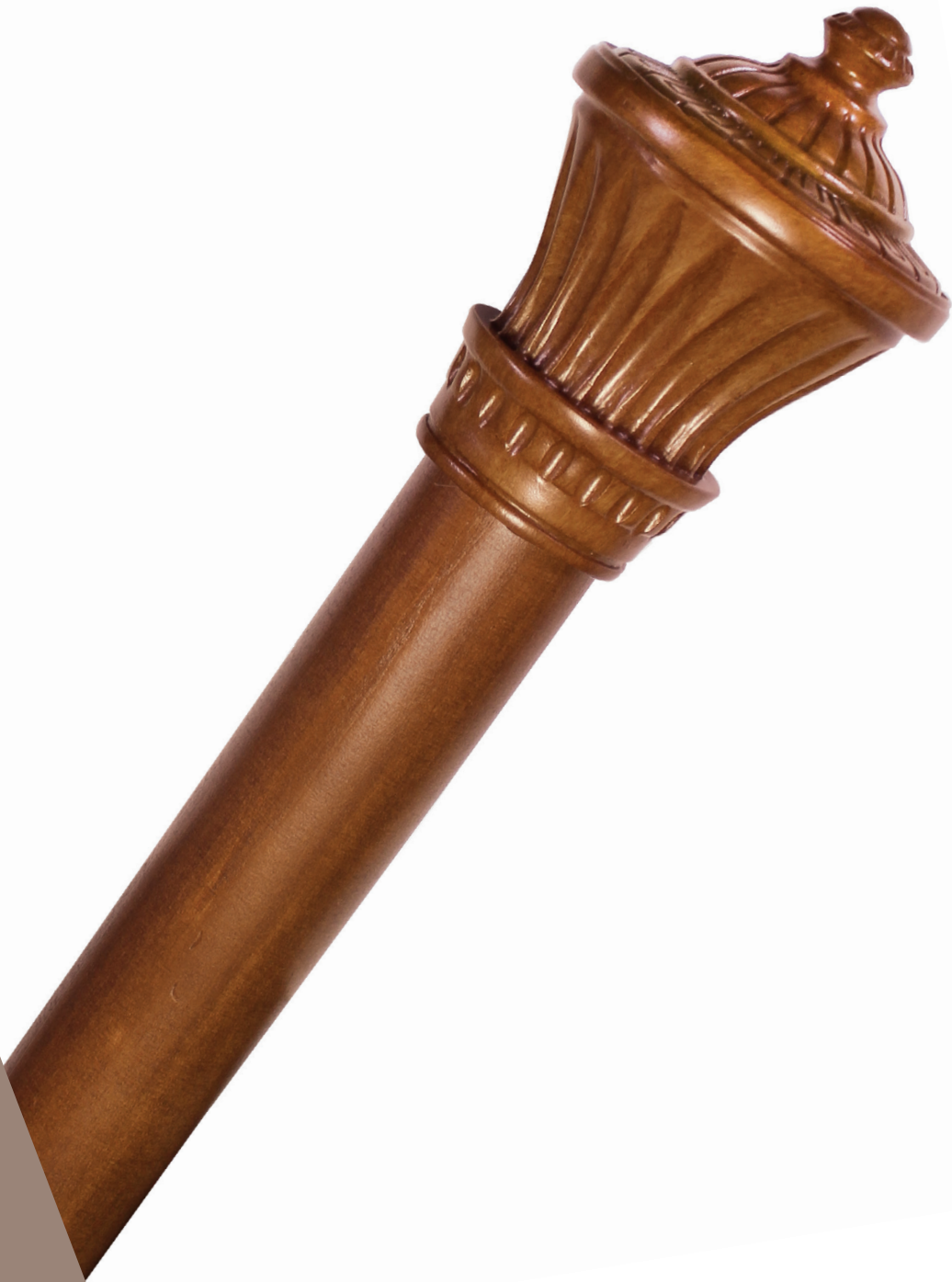
CHARLESTON Estate Oak Shown. Available in: 1 3/8", 2", 3".