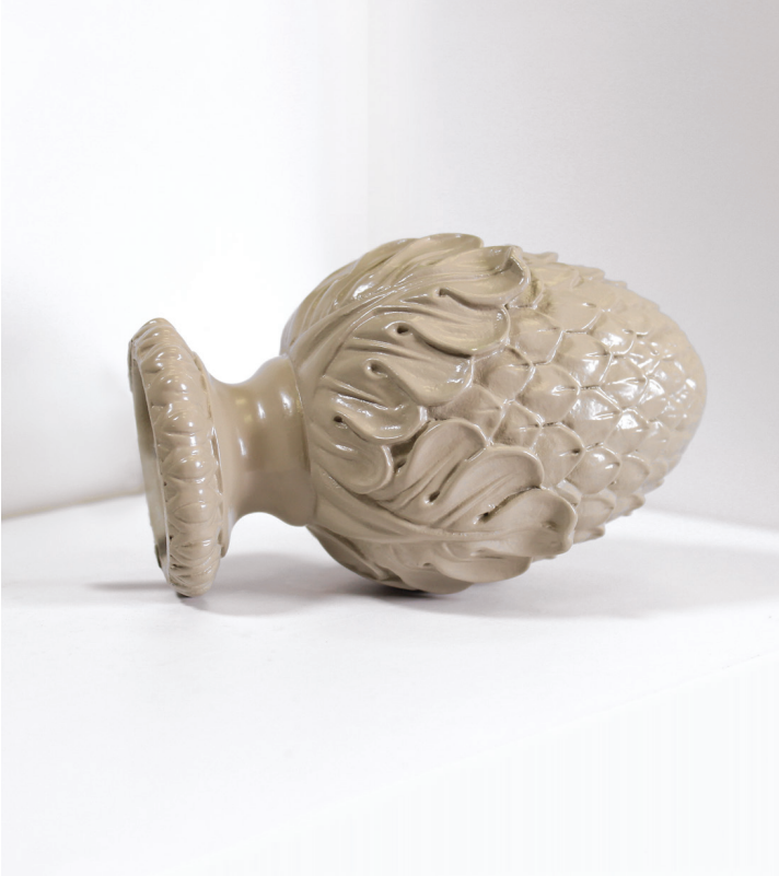
BRISTOL Marble Shown. Available in: 1 3/8", 2", 3".