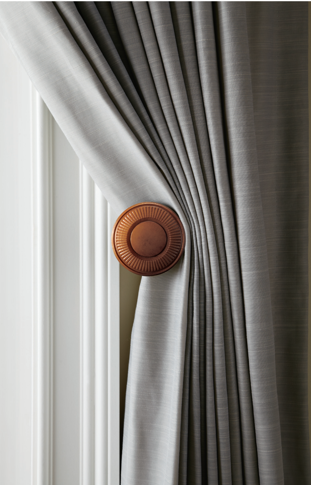
HOLDBACK Estate Oak Shown