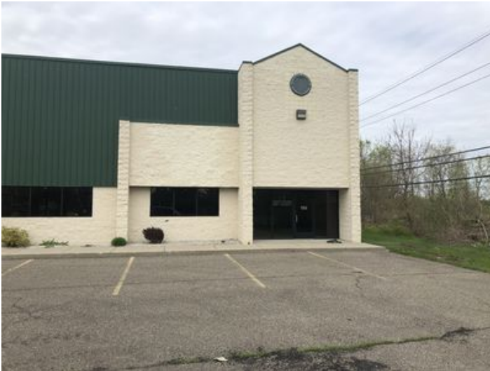
Northline Commerce Suite 106