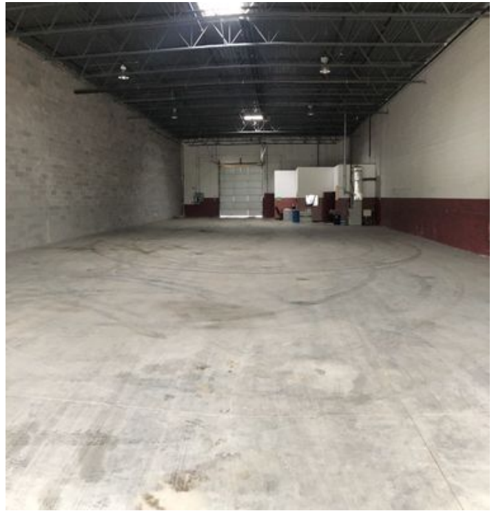
Northline Commerce Suite 106 (4)