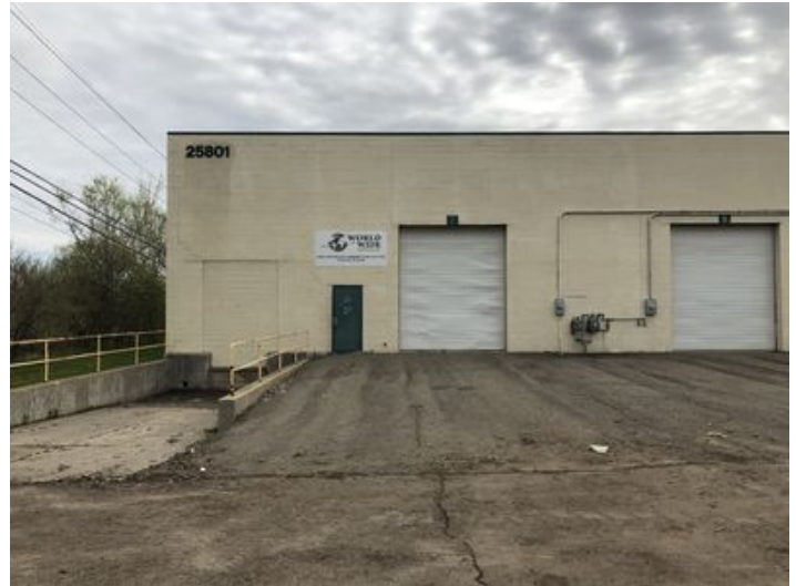
Northline Commerce Suite 106 (3)