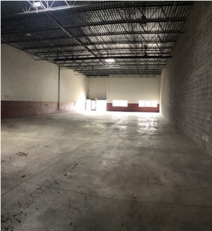
Northline Commerce Suite 106 (2)