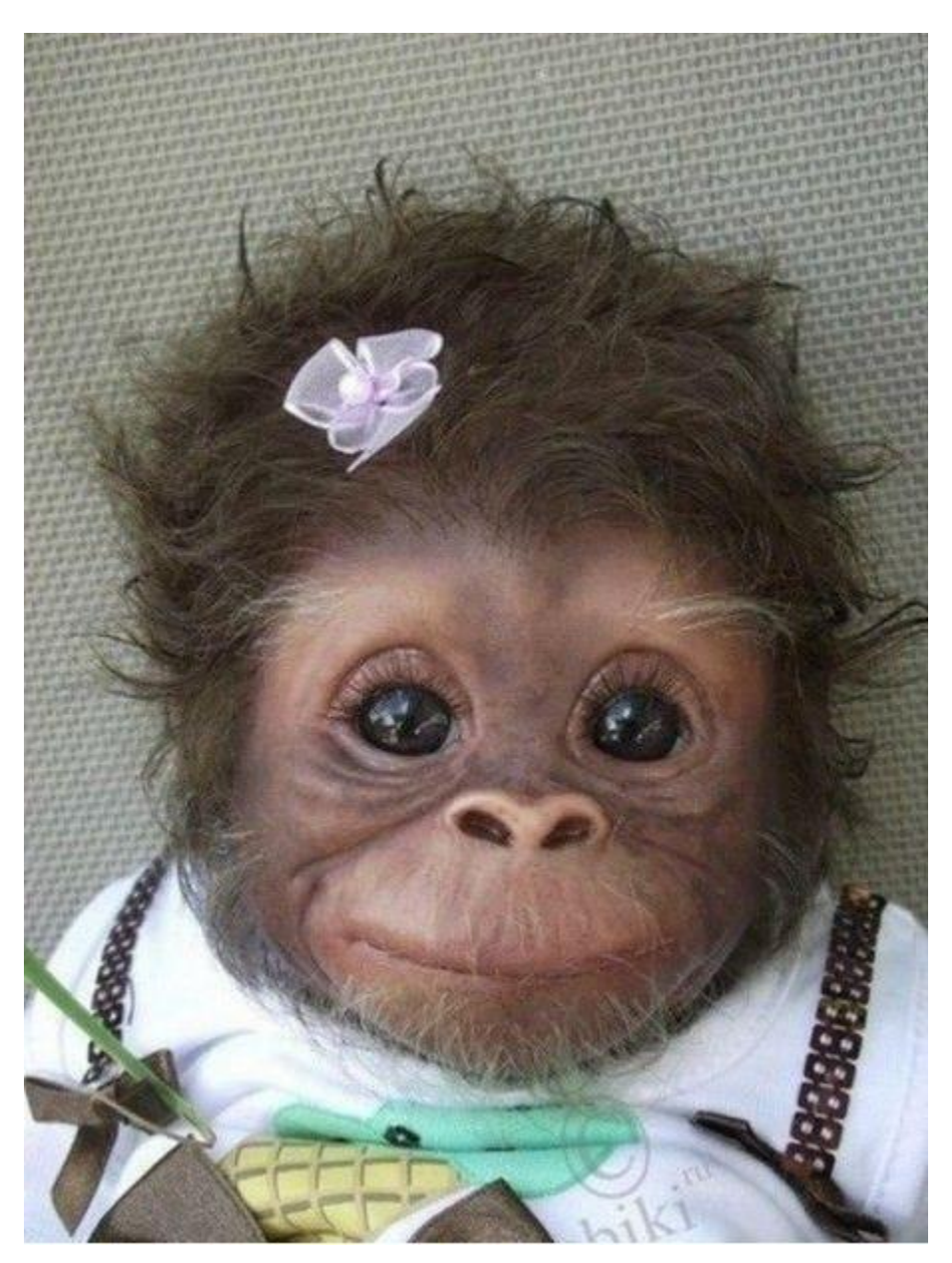
My brother is cute, too.