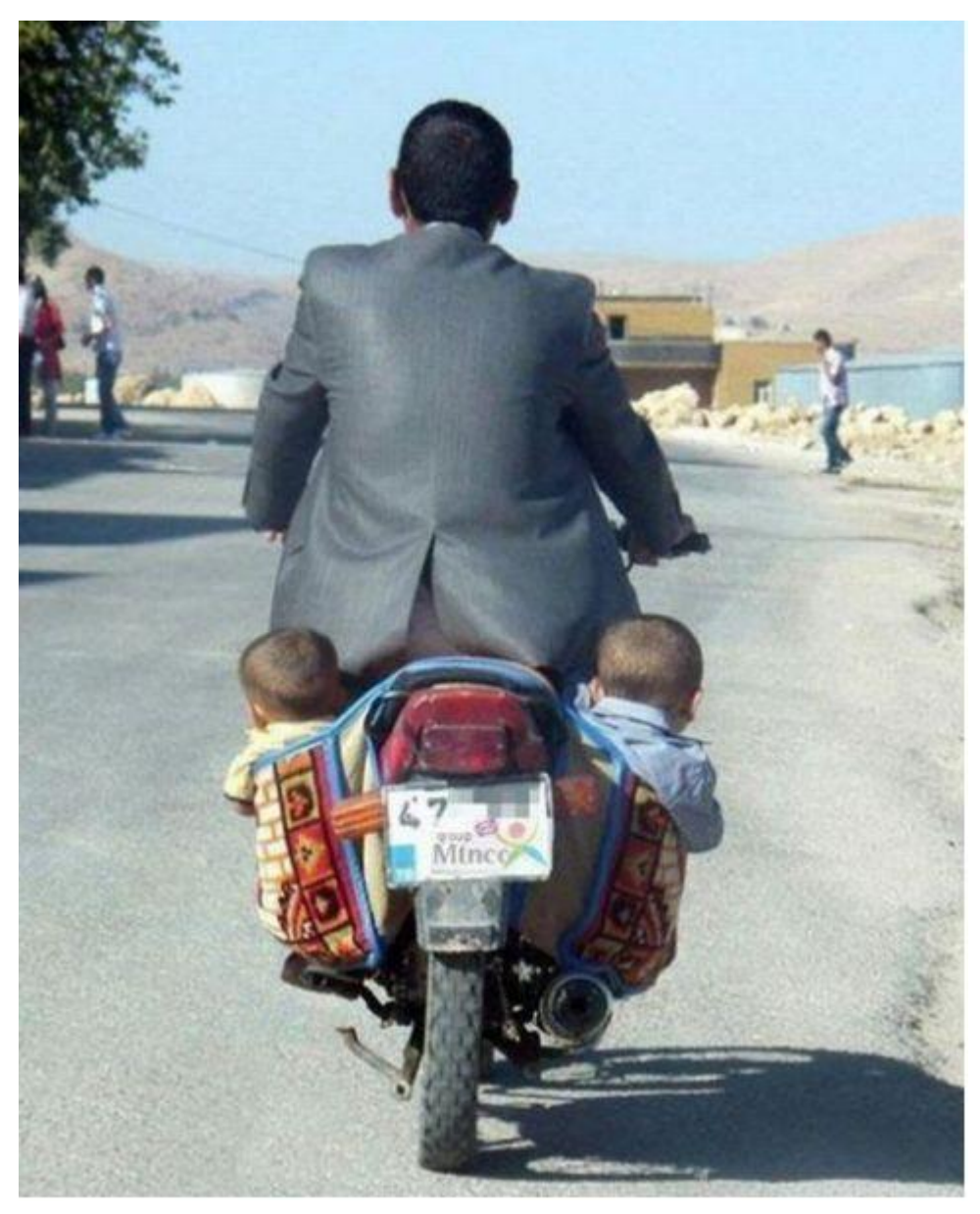
Dad! Can we just take the car next time? My butt hurts!