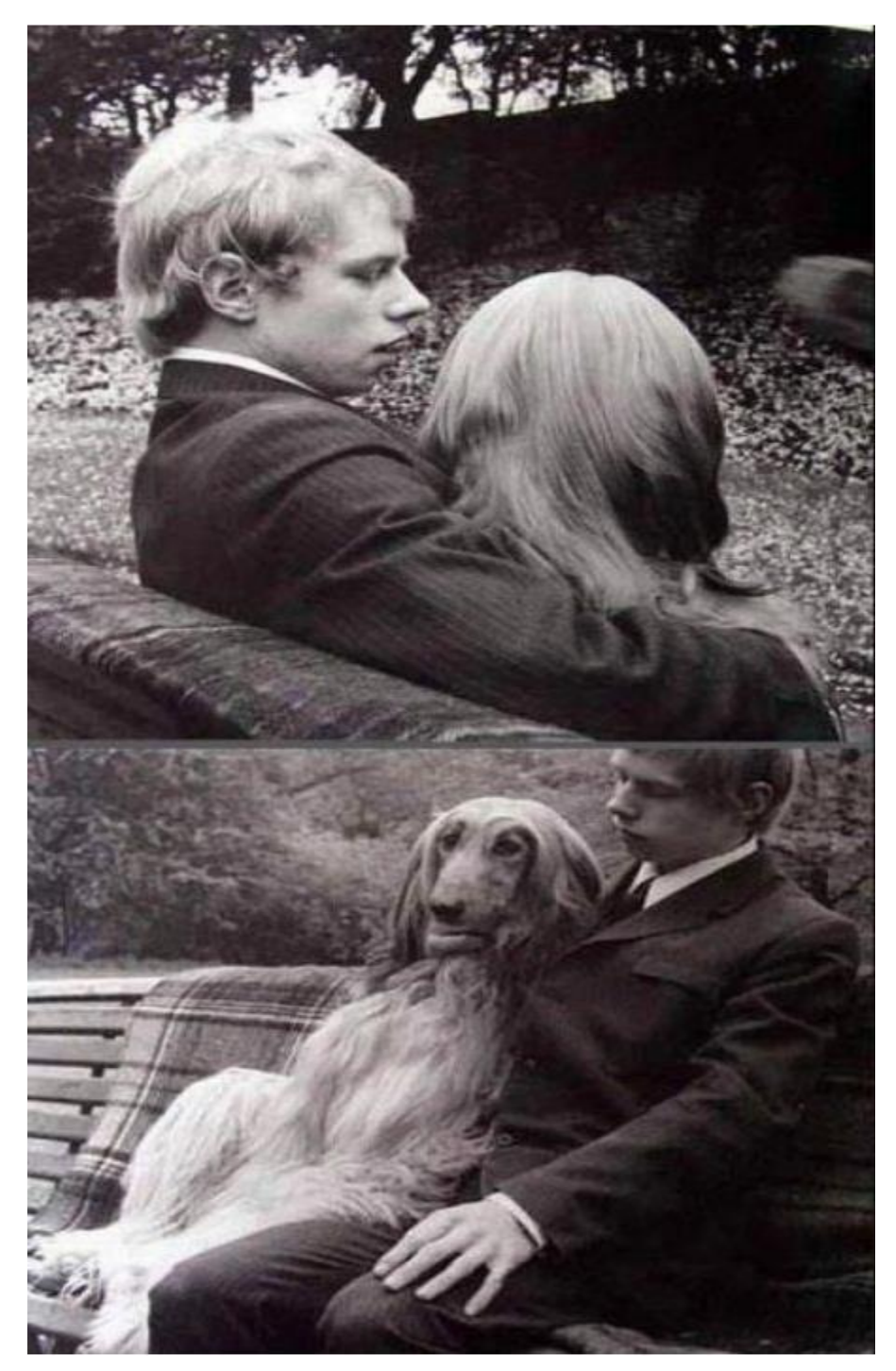
I agree. Sometimes it's nice to just sit and enjoy the peace and quiet.