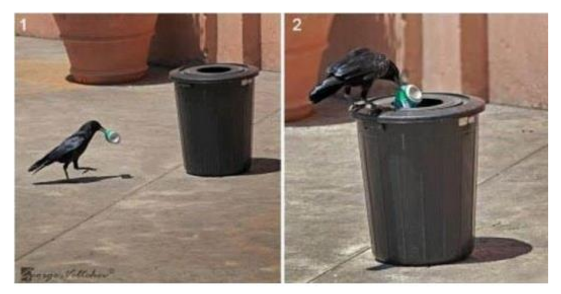
I just can't stand litterbugs!