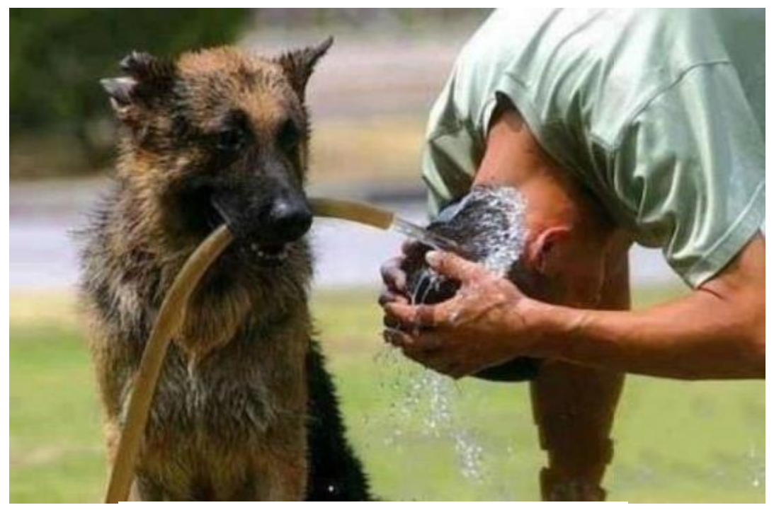
Do you want a "blow dry" with that?