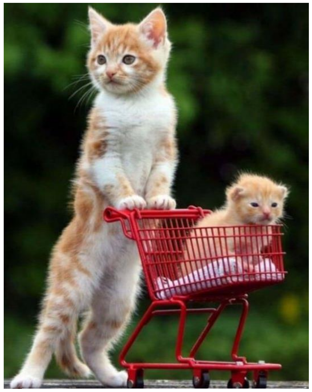
Where is your brother! I'm never taking him to the grocery store again!