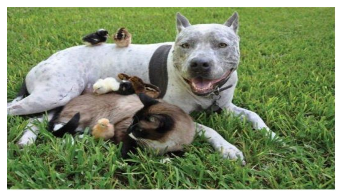
That's right. I'm a vegan.