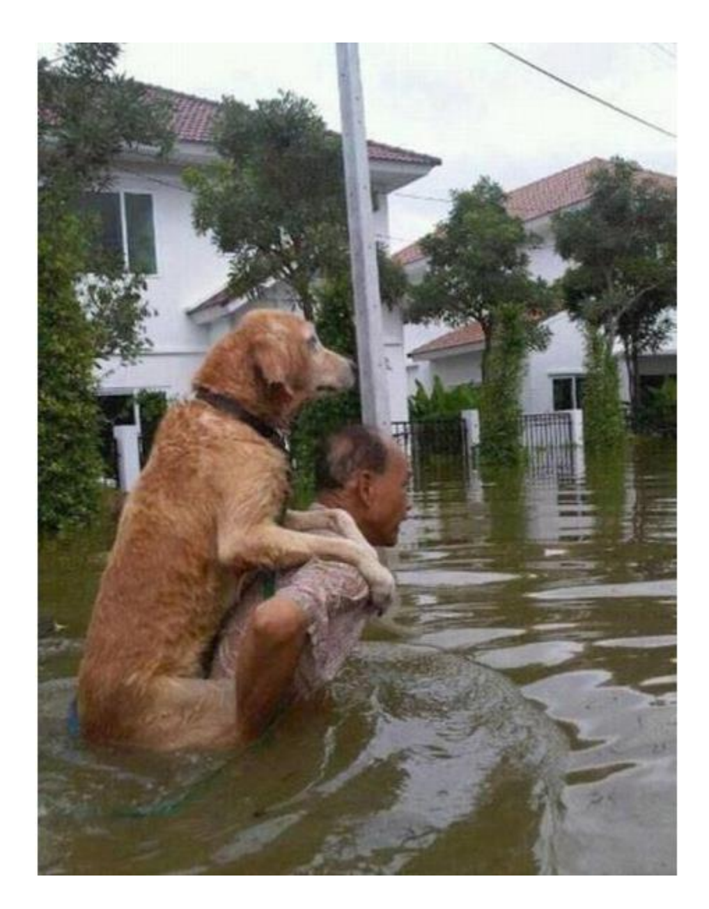
Master, I think you're "dog's best friend".