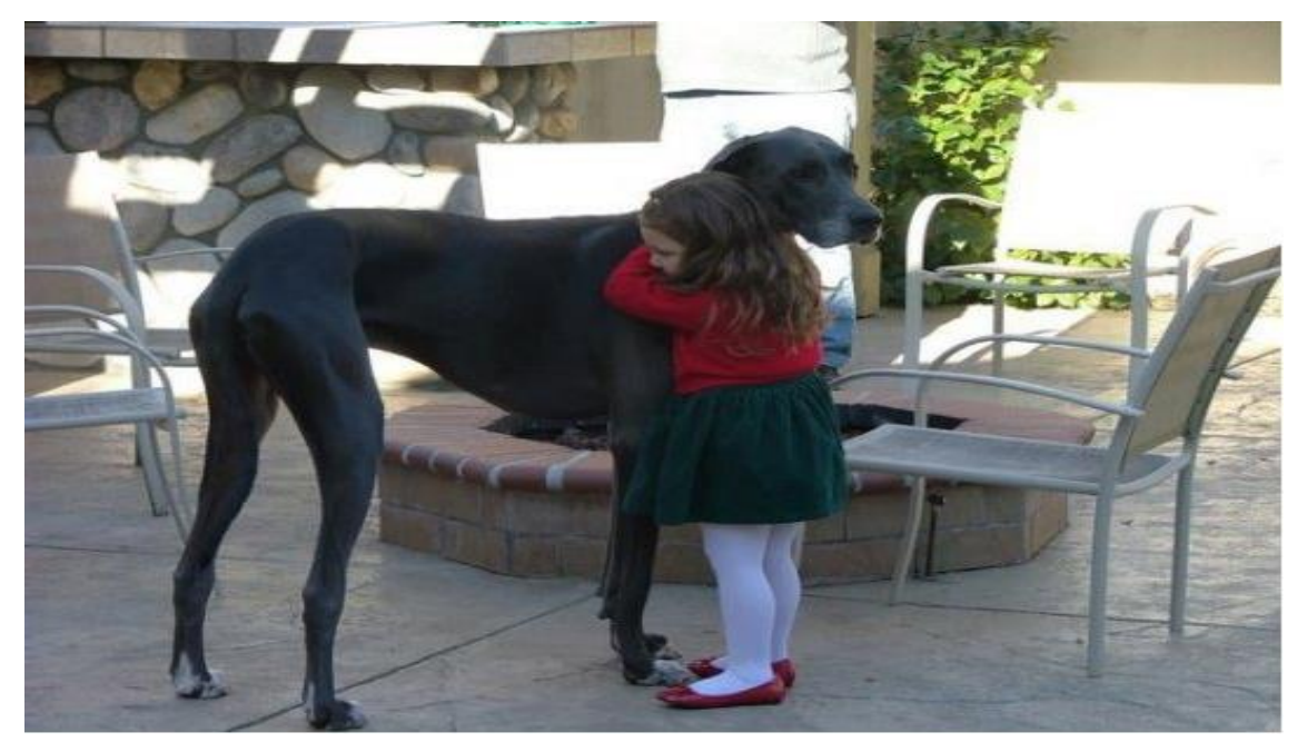
You're my very bestest friend in the whole world.