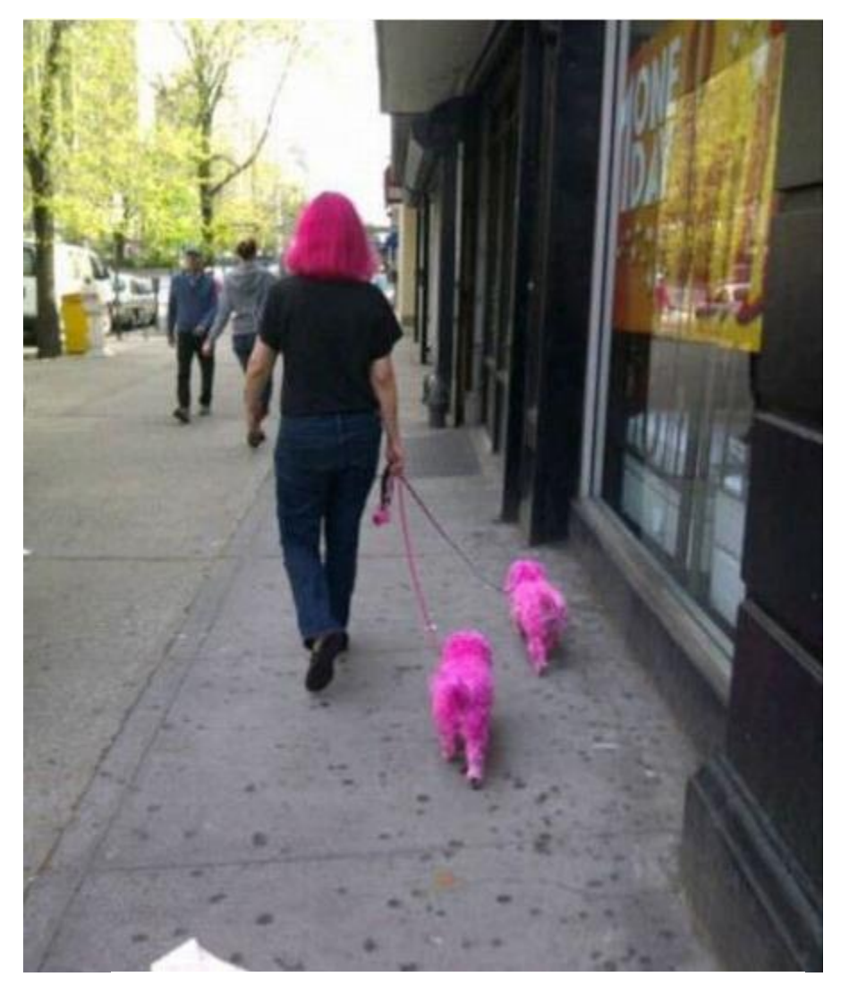
Yes. They're looking for a Walmart.