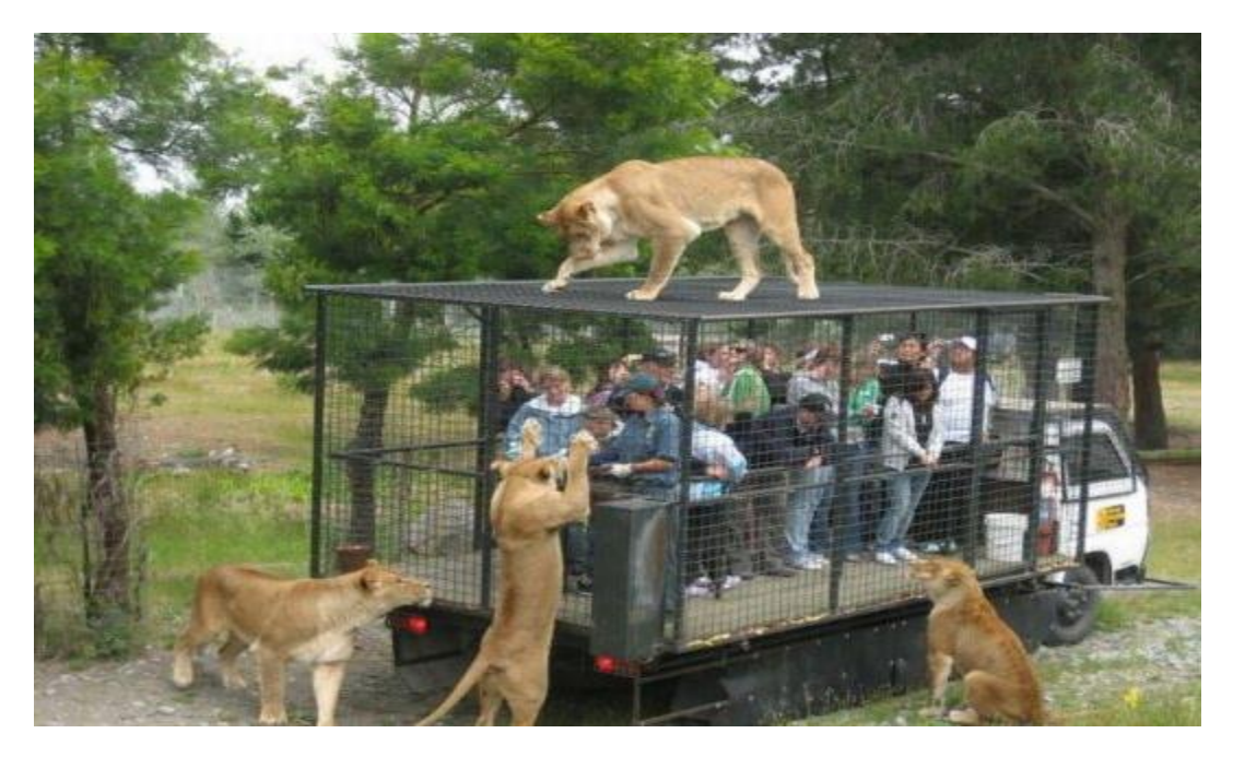
Ha, Ha! Look at the animals in the cage!