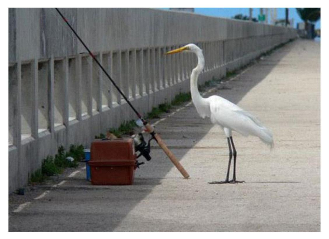
Come on, Fishee, Fishee, Fishee ...