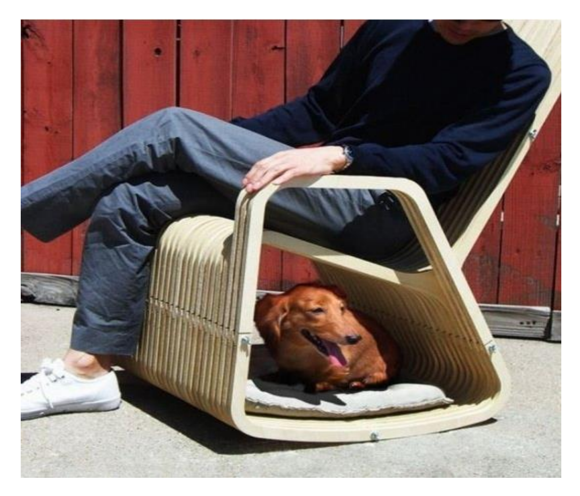
I really like the shade, but all this rocking is making me dizzy!