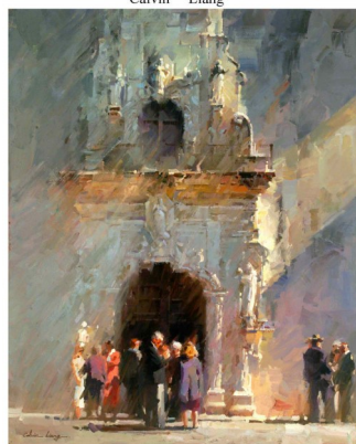
"Sunny Day in Mission San Jose" Oil on canvas 24"x30"