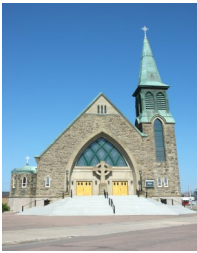
Saint Augustine's 340 Dominion Street Moncton, NB

December 31, 2017 Feast of the Holy Family