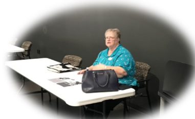
BEDFORD — (Top and right) Oakland City University Bedford presented a free event for veterans Sept. 30 at StoneGate Arts & Education Center.