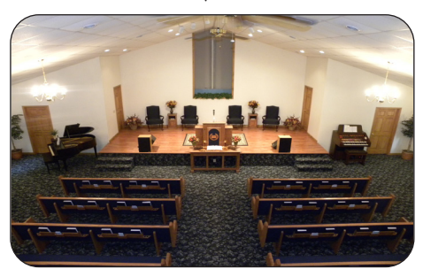
A ministry commissioned by Mt. Salem Baptist Church.

Mt. Salem Revival Grounds P.O. Box 186 \sim West Union, WV 26456 \sim 304.873.2315