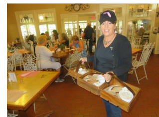
Lunch was delivered in unique picnic boxes.