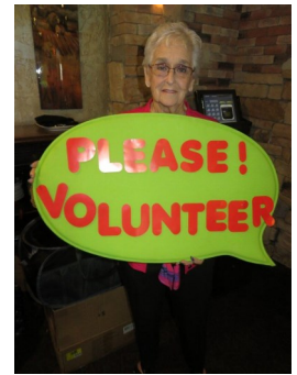
The perfect placard for our new president!