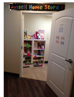
A view into the store at Russell Home