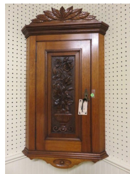
One of the many English antiques available for sale at The Barn