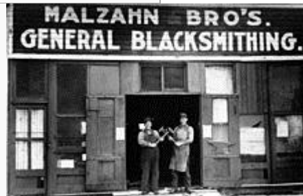
Malzahn Brother's General Blacksmithing shop