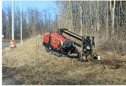
Ditch Witch JT1220 horizontal directional drill in operation in Hamburg, Michigan

Ditch Witch is an American brand of underground construction equipment built by