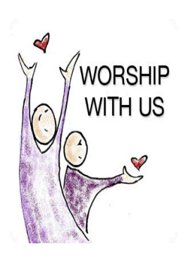
JANUARY 2023 Worship Calendar for Immanuel Lutheran, Erie PA