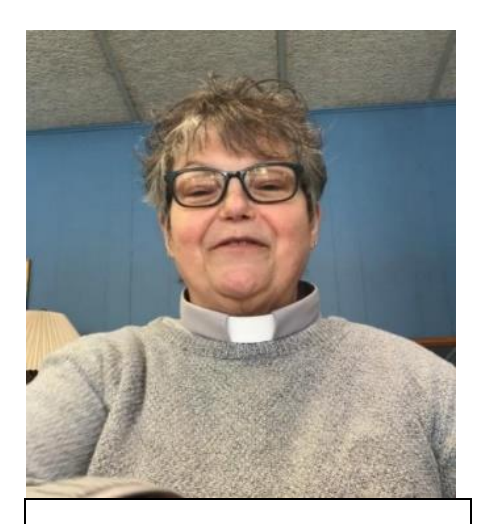
Grace & Peace from the Pastor's Desk

Trust in the Lord with all your heart, and do not rely on your own insight.