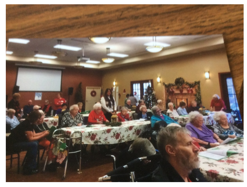
Part of Ct. St. Cecelia's Christmas program at nursing home.