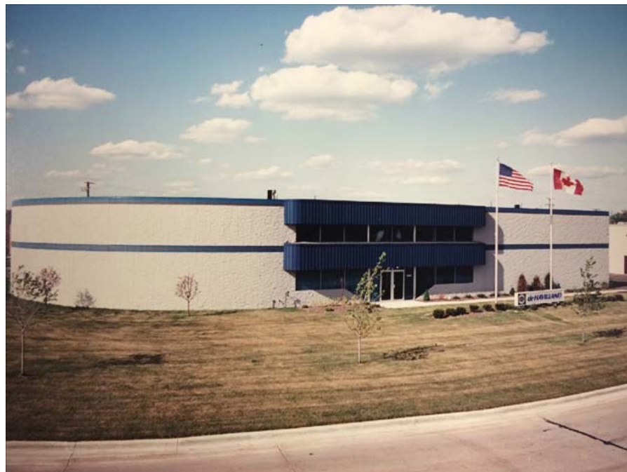
17000 sq.ft.12645 Delta