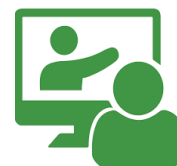
Post Training support