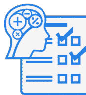
Online Aptitude prep