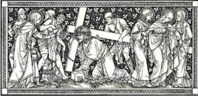
By: The Word Among Us

The Son of Man must suffer greatly...and be killed. (Mark 8: 31)