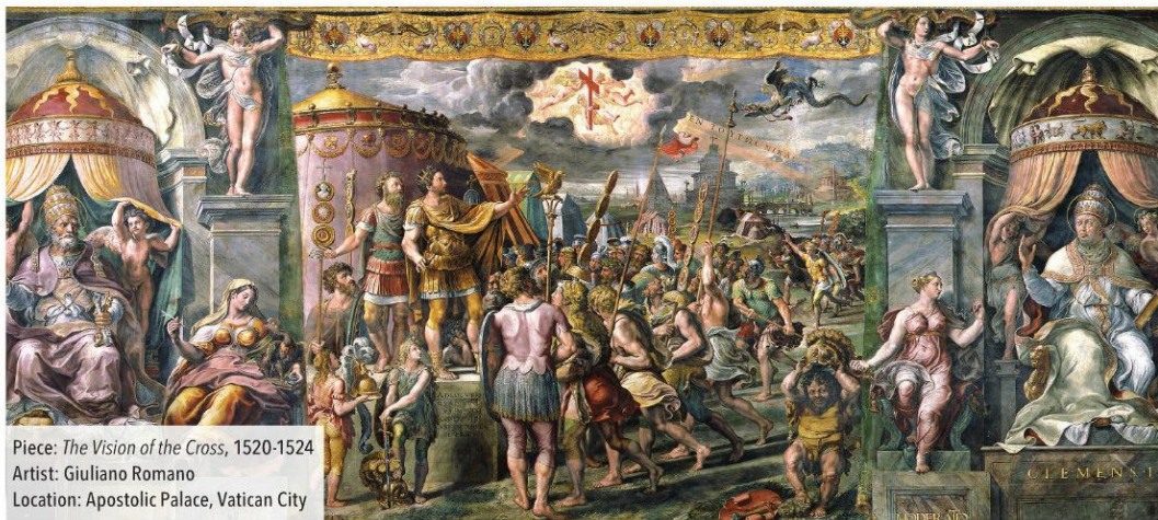
Piece: The Vision of the Cross , 1520-1524 Artist: Giuliano Romano Location: Apostolic Palace, Vatican City

Do I give more credence to fads or feel-good philosophies than to the truth revealed by Jesus?