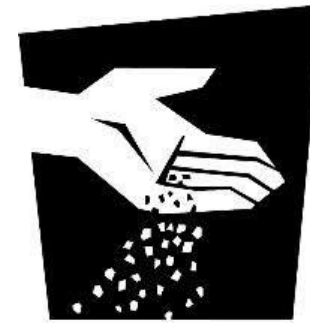
Mustard Seed Faith