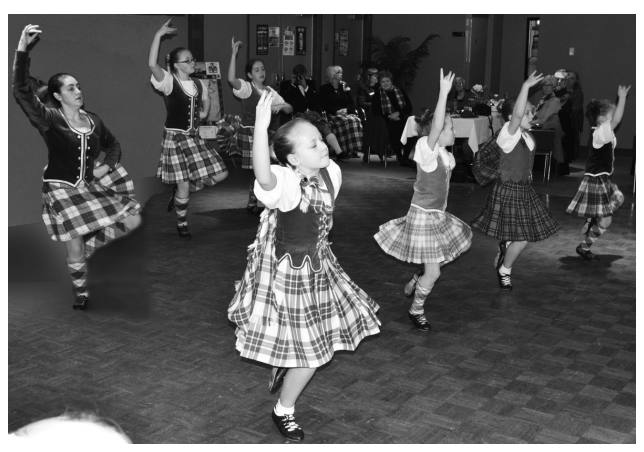
Spring, 2013 Page 7