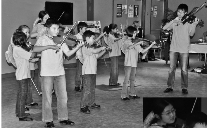
At the Burns event, CMS Greater Vancouver members and guests were entertained by a young and very enthusiastic group of fiddlers with a very broad musical repertoire