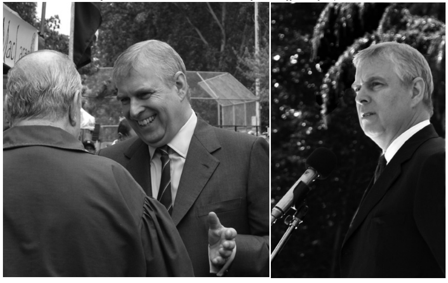
CMSC Newsletter # 58, Page 14