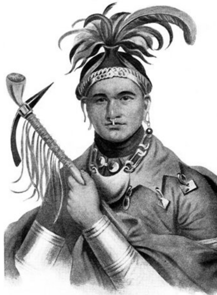
Cornplanter (1750-1836) was a Seneca war chief and diplomat