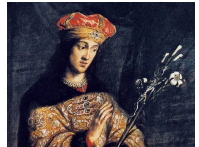
Feast Day: March 4