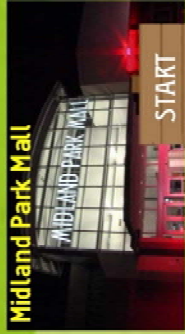
Midland Park Mall

Departure Times From Mall Express 6:15am 2:45pm 6:45am 3:45pm 7:45am 4:45pm