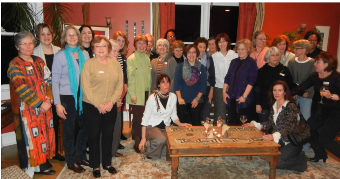
Donors and friends enjoying the 9 th Annual Women's Cocktail Party

Please forward this newsletter! Let's continue to work together to help make a brighter future for more young women, and in doing so make a better, more equitable world.