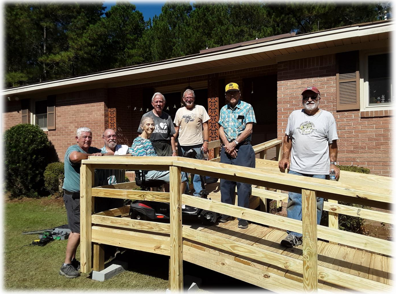
Mt. Hermon Lutheran Men's Project Wheelchair Ramp Ministry September 23, 2019