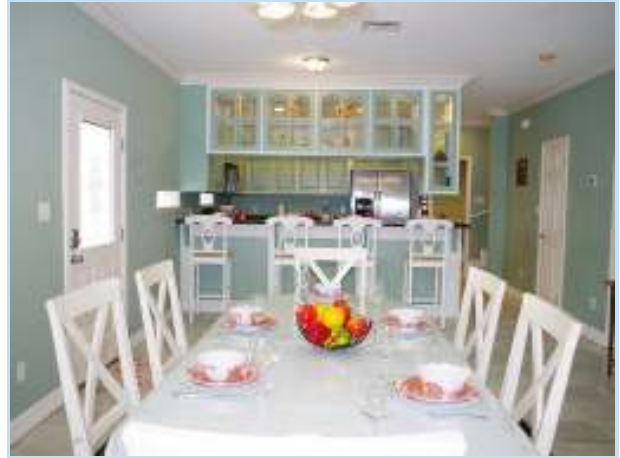
seating for 6