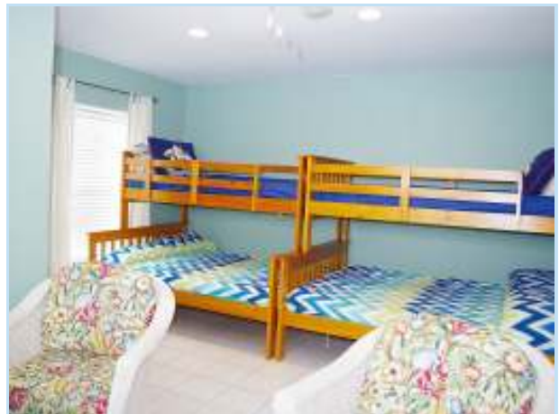
Guest Bedroom 3