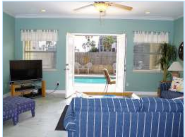
Enjoy indoor-outdoor living!