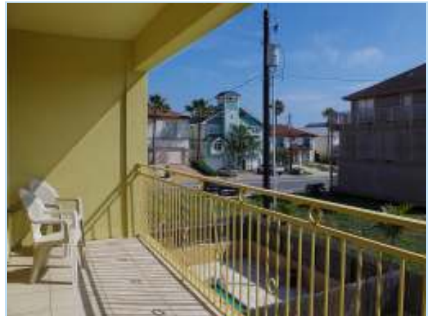
guest bedroom balcony overlooks the pool