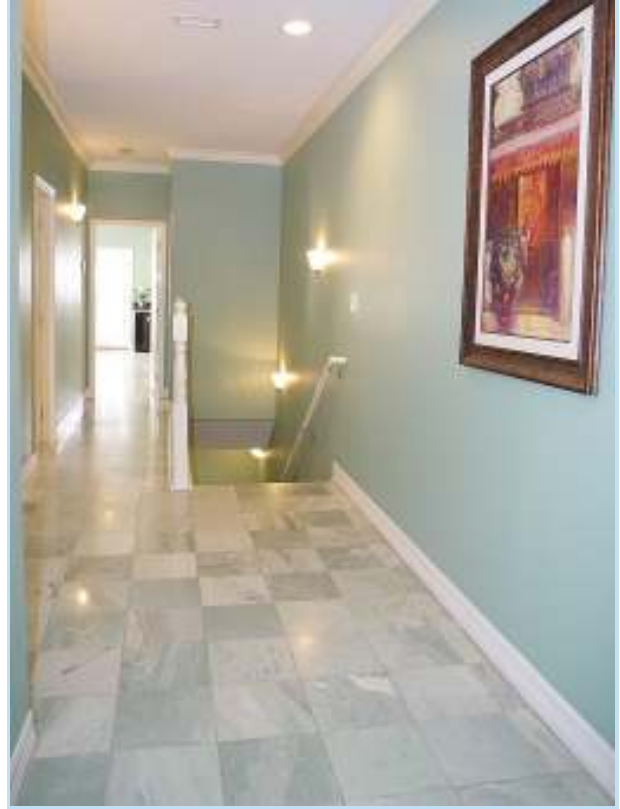
beautiful marble flooring throughtout