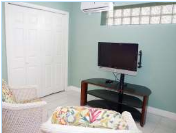
spacious walk-in closet