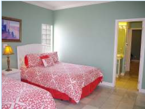
Guest Bedroom 1