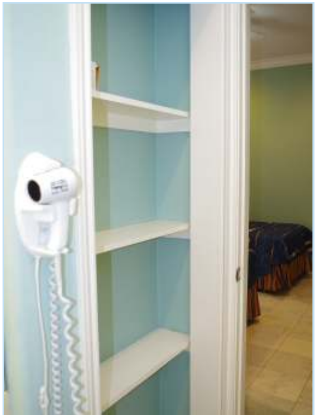
Upstairs Guest Bath