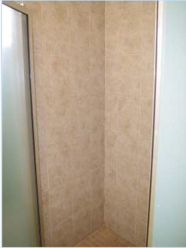
custom tiled shower