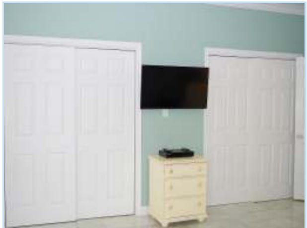
two large closets in master