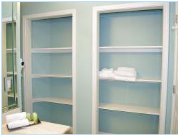
lots of storage space in guest bath