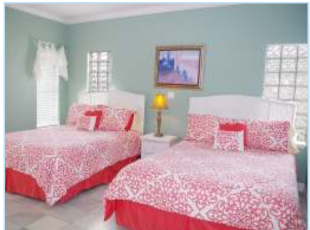
room for 2 queen beds in guest bedroom