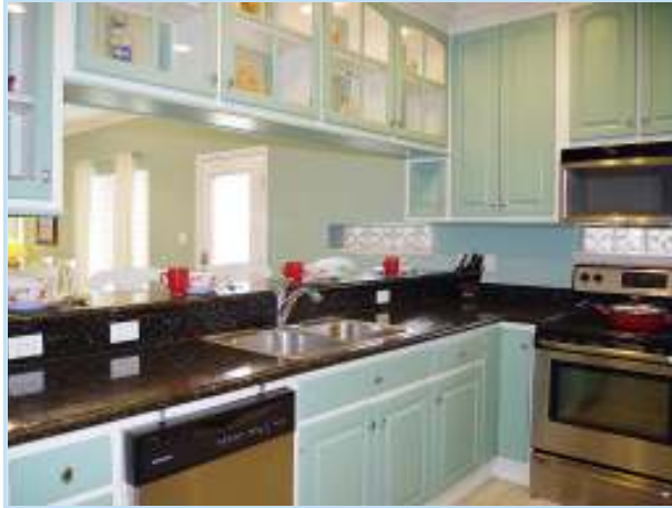
gorgeous granite counters