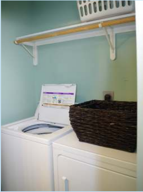
full size washer and dryer