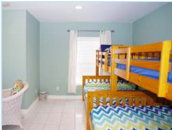
"bunk room" sleeps 6