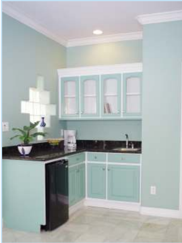
master suite has wetbar with sink and fridge