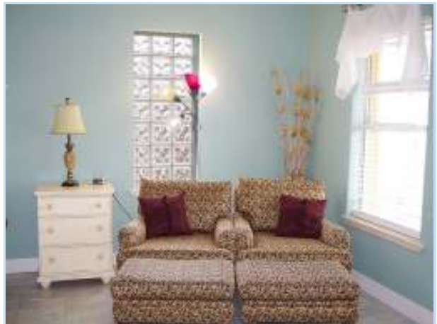
master suite sitting area