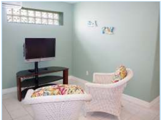
Guest Bedroom 3