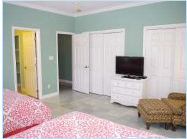
two closets in guest bedroom