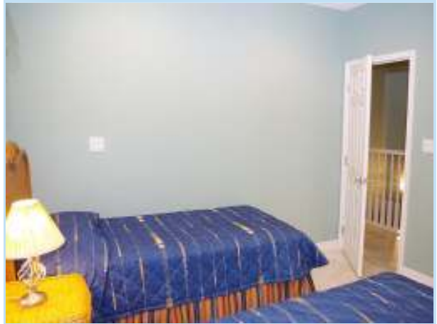
Guest Bedroom 2