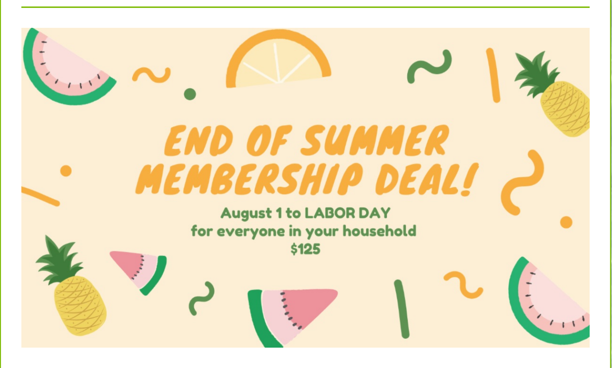
Register and pay online at our website @ www.lakewoodrc.org