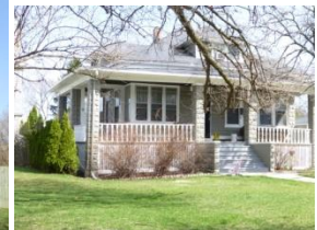
c. 1919, E. Highland