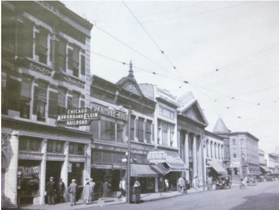
Photo - Former CAE Station in Aurora, IL