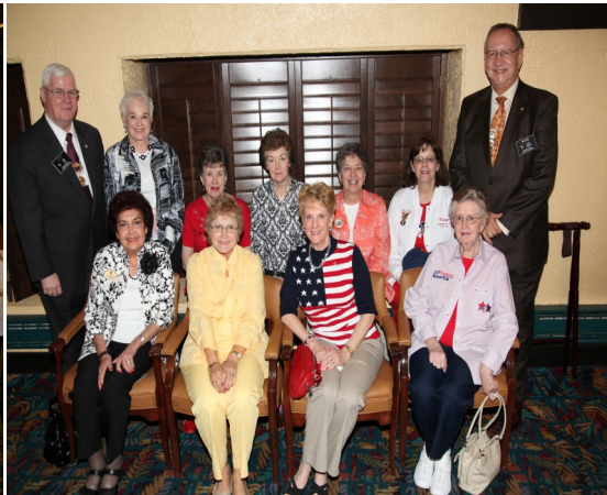
The Real IALOH Commanders