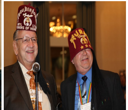
There is a Clown In Every Butch