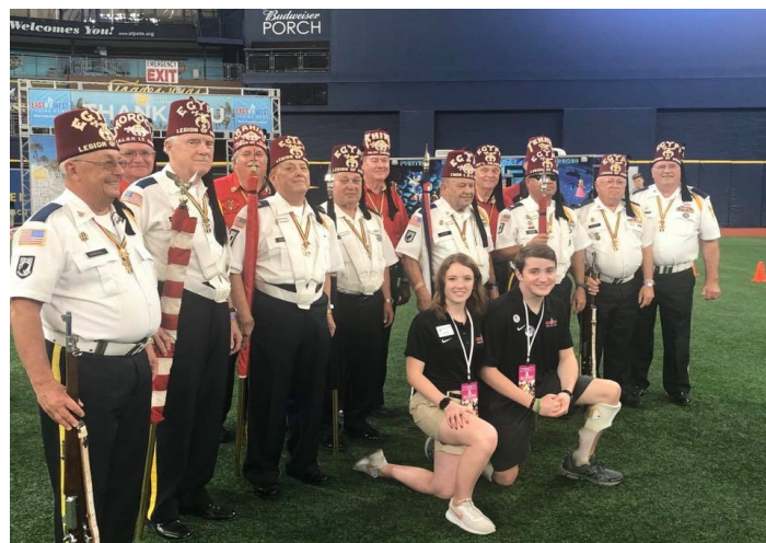
International Officers and Egypt Color Guard at the 2020 East/West Shrine Bowl