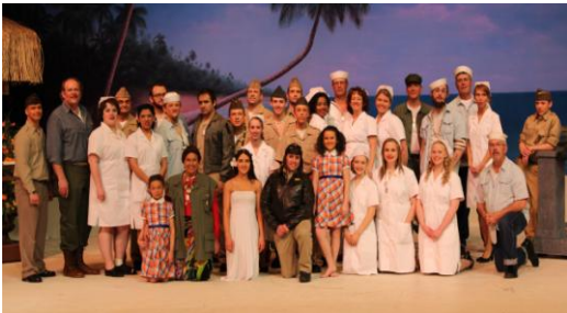
2014 MUSICAL - SOUTH PACIFIC