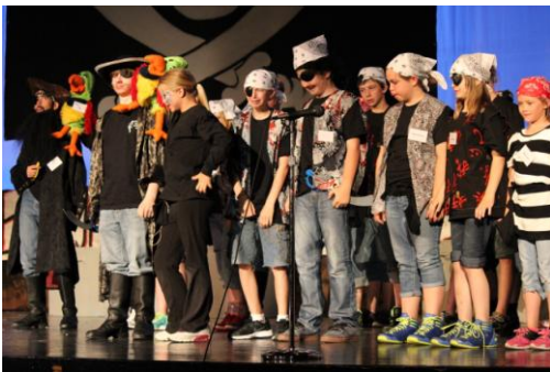
2014 CHILDREN'S THEATRE WORKSHOP