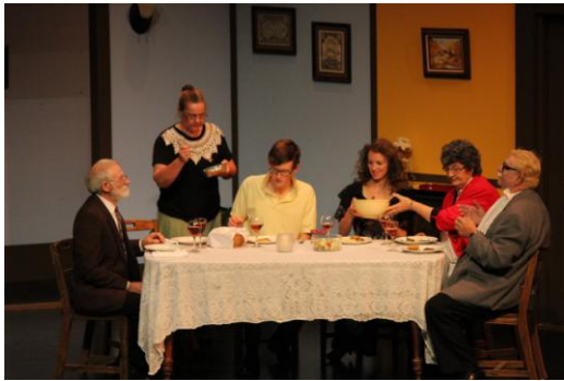
2013 PLAY - OVER THE RIVER AND THROUGH THE WOODS