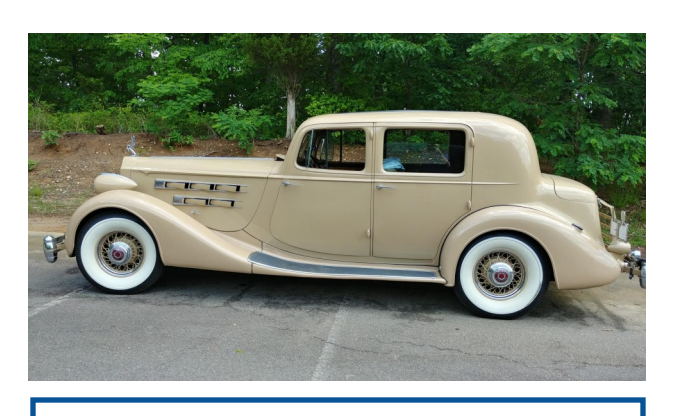
1935 12-Miles White