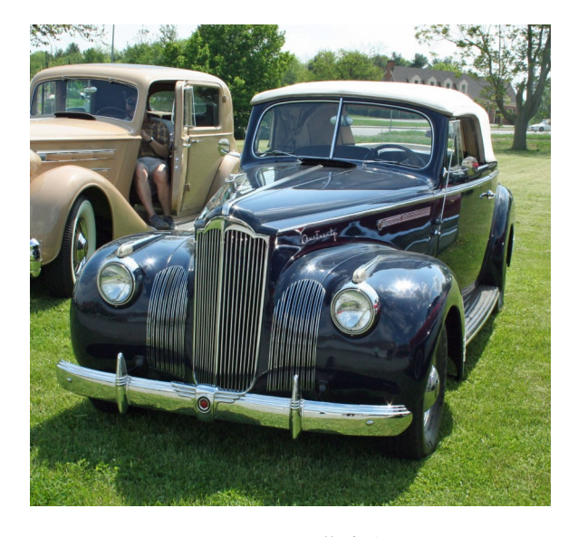
1941 120 — Bill Aske