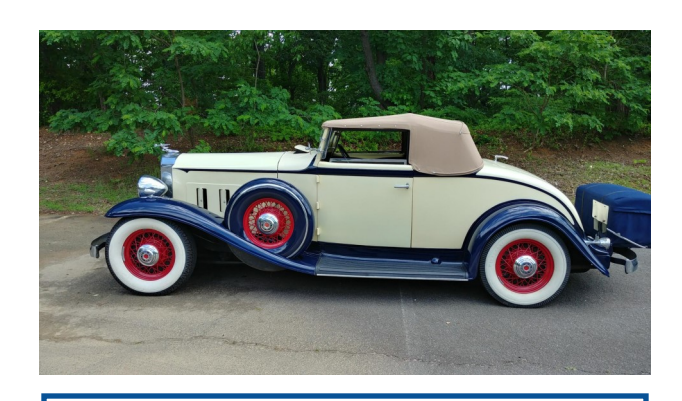
1932 Light Eight-Bob Montague