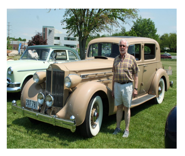
1935 12-Miles White