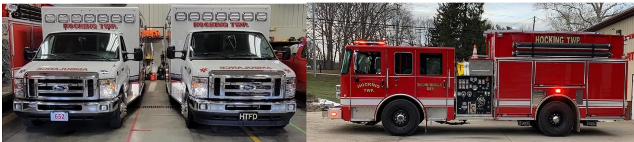
Medic/Squad 651 & 652