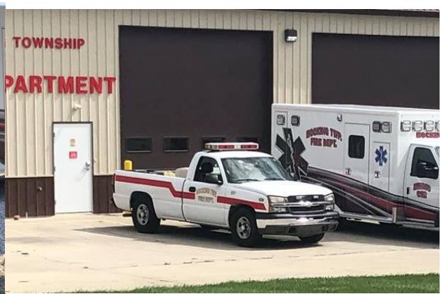
Station Truck 652