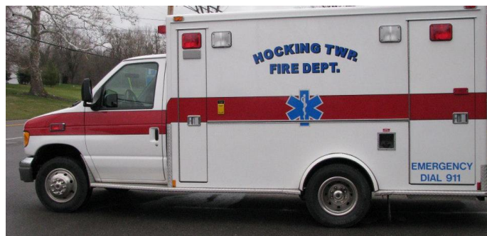
Reserve Medic/Squad 653