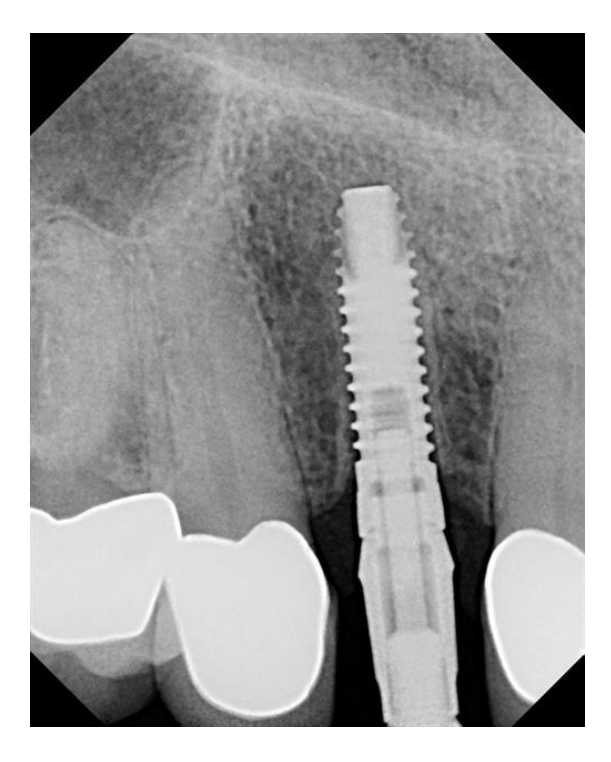
Fig.9: PA to confirm seating