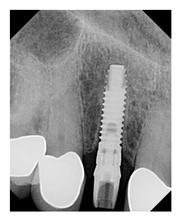
Fig.11:Stock abutment PA to confirm seating