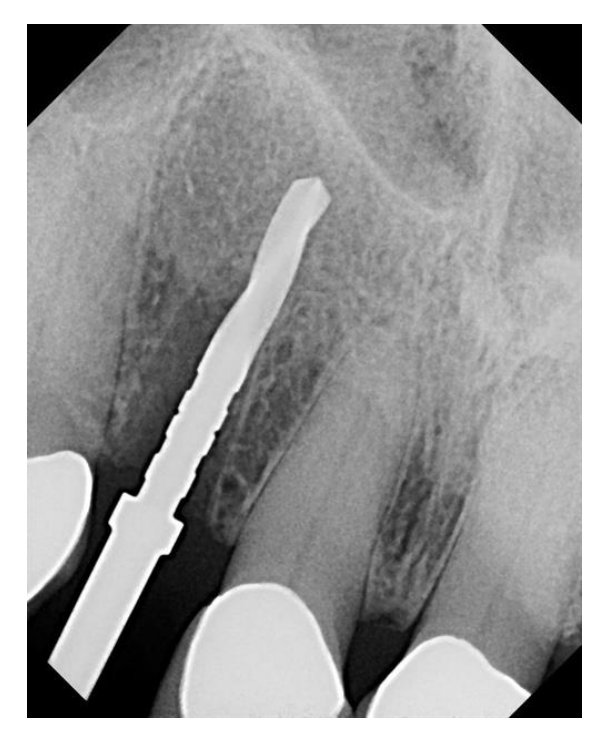
Fig.4:PA post extraction with 15mm 2.0 drill