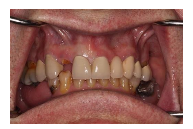
Fig,1. Fractured lateral