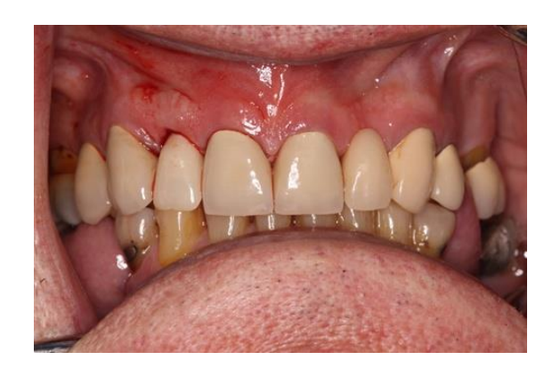
Fig.7:Temp in mouth the day of surgery