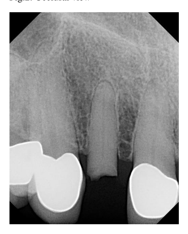
Fig.3: Initial PA