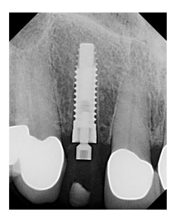
Fig.5:PA of implant with screw retained temporary