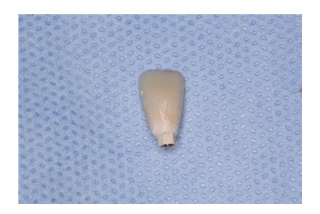
Fig.6:Peek prefab abutment with stock temp crown