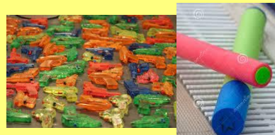
Water Wars Party Pack for 50 $150/hr (Incl water guns, water balloons, sling shots, much more)