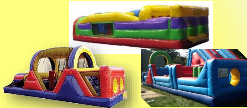
30-37ft Obstacle Courses $350 for 1 st 2 hours $50 per hour thereafter **MOST POPULAR**