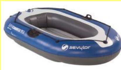
Inflatable Rafts 2 rafts and 1 staff member $100/hr