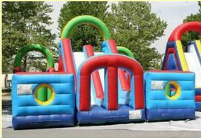
Huge 3pc Obstacle Challenge $700 for 1 st 4 hours (Dry) $100 per hour thereafter (Requires 3 elec outlets)

Not Pictured: Large Slides $400 for 1st 2 hours $50 per hour thereafter