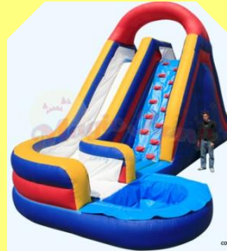
Huge Double 16ft Infinity Wet/Dry Slide $550 for 1 st 4 hours (Dry) $650 for 1 st 4 hours (Wet) $50 per hour thereafter