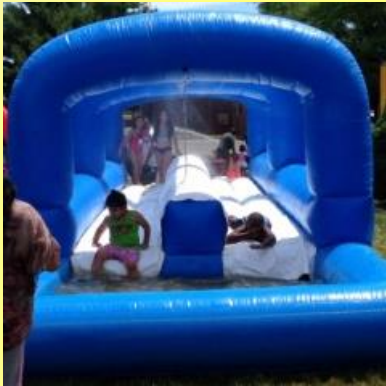
Giant Slip and Slide $400 for 1st 2 hours $50 per hour thereafter

Need Electricity? Generators - $100ea per event