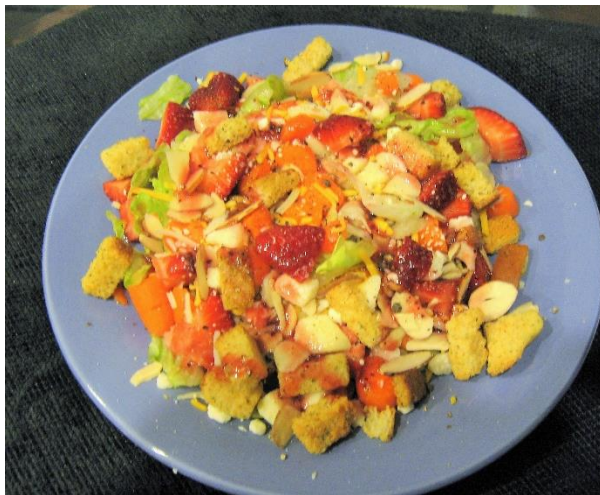
13. Summer Salad with fresh strawberries, raspberries, carrots, toasted almonds, croutons, and topped with a raspberry vinaigrette