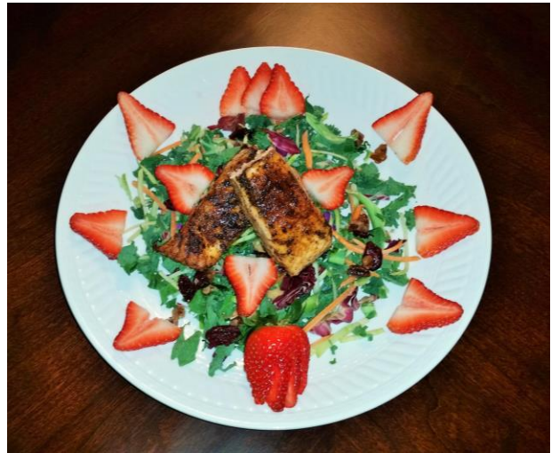
22. Grilled Salmon Kale Salad with candied pecans, carrots, radicchio, and dried cranberries and paired with fresh strawberries