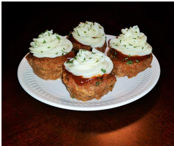
21. Meatloaf cupcakes topped with fresh whipped mashed potatoes