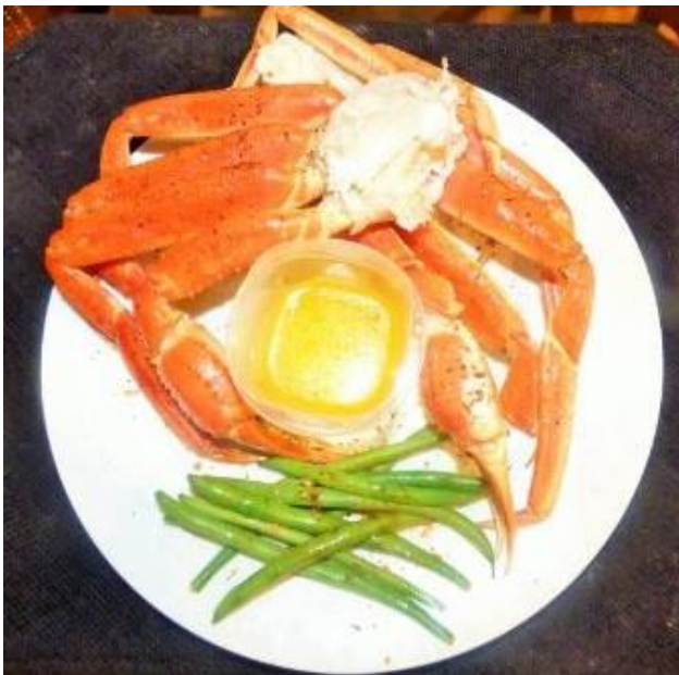
17. Smoky Mesquite snow crab and Cajun green beans