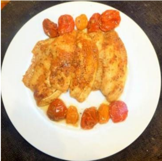
20. Roasted Tilapia with Heirloom tomatoes