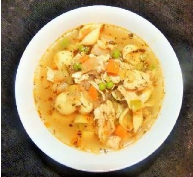
16. Homemade chicken noodle soup