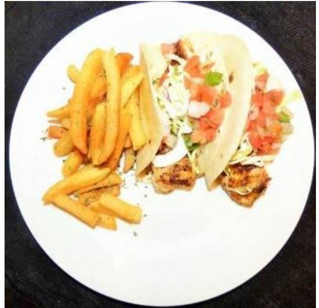
18. Grilled Mahi Mahi tacos topped with fresh Pico de Gallo and paired with seasoned fries