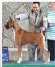
GCH Quail Run's Walk Off Home Run

GCH R And G's Brightest Star, DOM X A/C CH Encore's Bismark, GSOM, litter.