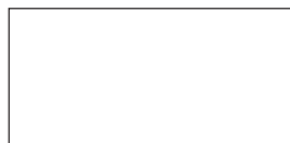
12x24 Textured Outdoor