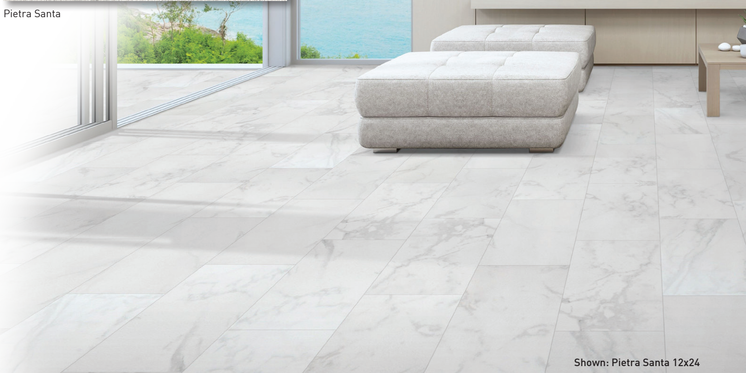
Shown: Pietra Santa 12x24