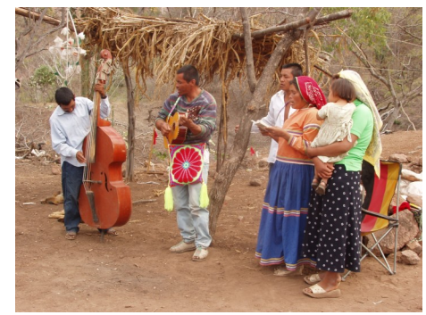
SDA Huichol in new village, Agues Frias, making Sabbath music

At the end of the services, the church members played and sang, using a bass fiddle and a guitar, neither tuned together, but the