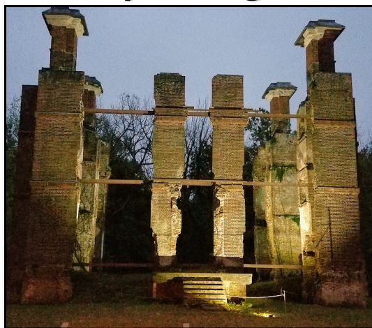
The beauty of the Ruins is striking under the nighttime skies. Rosewell is aggressively pursuing using the Ruins more for weddings, community, and business events.

2017 was a very productive year for The Rosewell Foundation, largely due to the implementation of the Strategic Planning Initiatives adopted by the Board of Directors during 2017. Comprised of one-year, five-year, and ten-year goals, the Strategic Planning document is the roadmap to Rosewell’s current and future success.