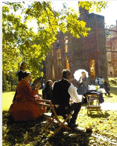
With the Ruins as a backdrop, the Civil War re-enactors brought Rosewell's 19th century history to life at the annual BBQ.