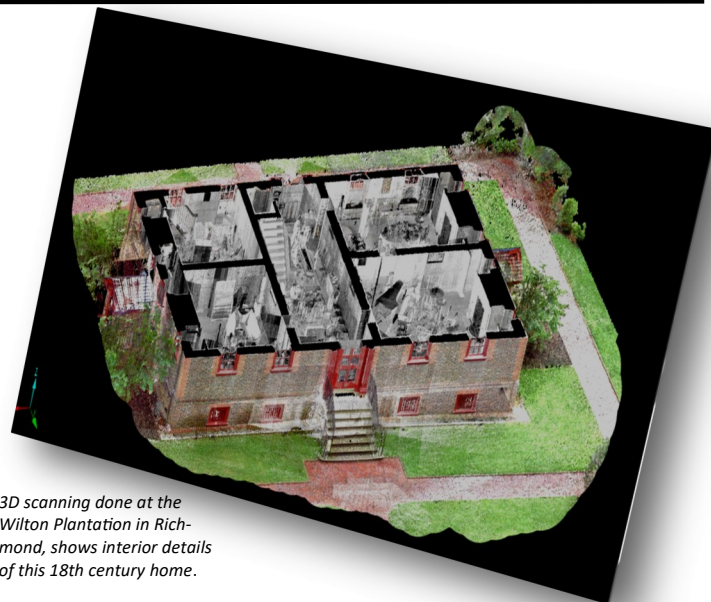
3D scanning done at the Wilton Plantation in Richmond, shows interior details of this 18th century home.

The firm of Mesick Cohen Wilson Baker Architects will be responsible for the project. They have completed a number of similar projects, including the Wilton Plantation (pictured) located in Richmond, Virginia. Wilton, like Rosewell, was built in the 18th century and was the ancestral home to members of a powerful gentry family (The Randolphs). In addition, the firm has achieved national prominence with the restoration of numerous National