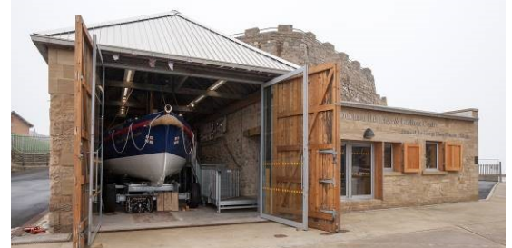
East Durham Heritage and Lifeboat Centre

Or perhaps you want to kick off your shoes and feel the sand between your toes on the beautiful Slope Beach.