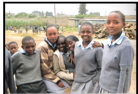
MCDC upper grade kids