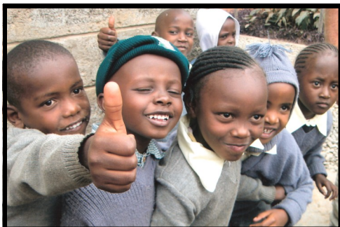
MCDC lower grade kids

Then Ruby and I gave each one a “TRUTH FOR YOUTH” Bible which we carried in from the U.S. There are \pm 100 students in 9th - 12th grades at MCDC.