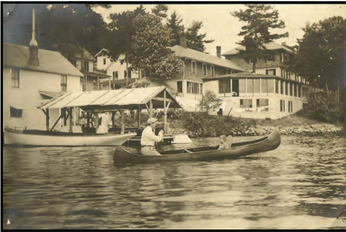
Original Island Harbor House, Hague Historical Museum , Photo Circa 1908

The Ticonderoga Sentinel of September 28, 1933, had this tale to tell: