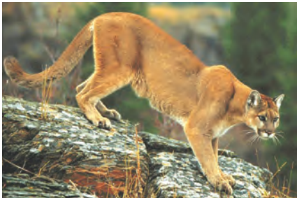
"Has anyone seen this animal in Hague?"

Climbing down the snow bank off the side of the road wasn't an easy task. The last dumping of snow was a week gone by and the rain and thawing that followed had left a deep, soft, corn-snow. I had sunk up to my thighs and when I tried to climb out, ended up sliding ungracefully to the bottom of the embankment on my butt, obliterating the tracks I was following. Though my method of descent was unplanned, it proved to be quick and painless and I was soon back to following tracks in the snow.