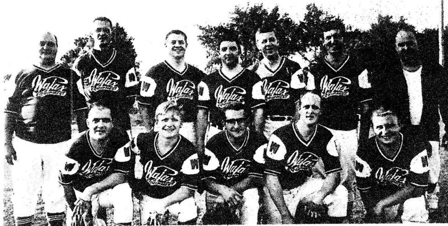
1969 TEAM - WAJAX EQUIPMENT LTD.