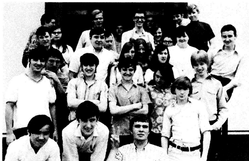
High School of Commerce grade 10 class, 1969

The dome of discovery at the Festival of Britain, 365 feet wide, is believed the largest dome in the world.