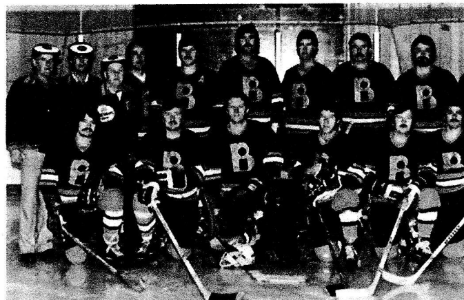
Prescott Hotel O.B.I. 14 years Champions R.A. 30 over