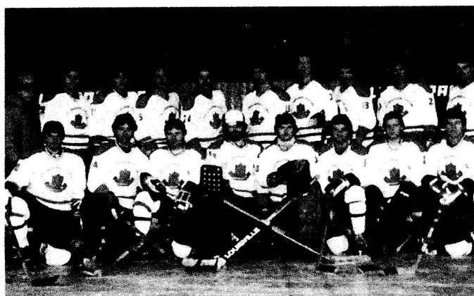
Ottawa Warriors Championship Team in France and Italy