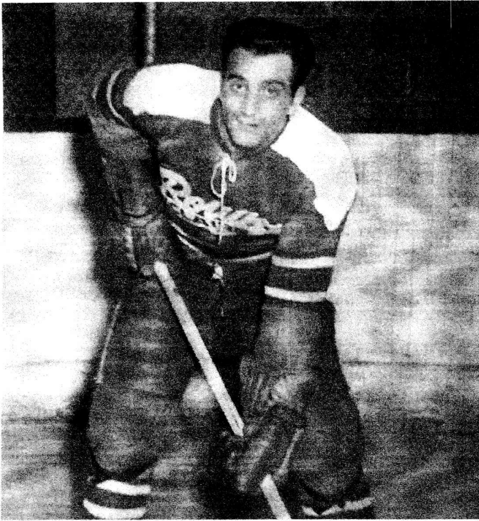
The following obituary appeared in The Ottawa Citizen , Saturday, June 12, 2010.