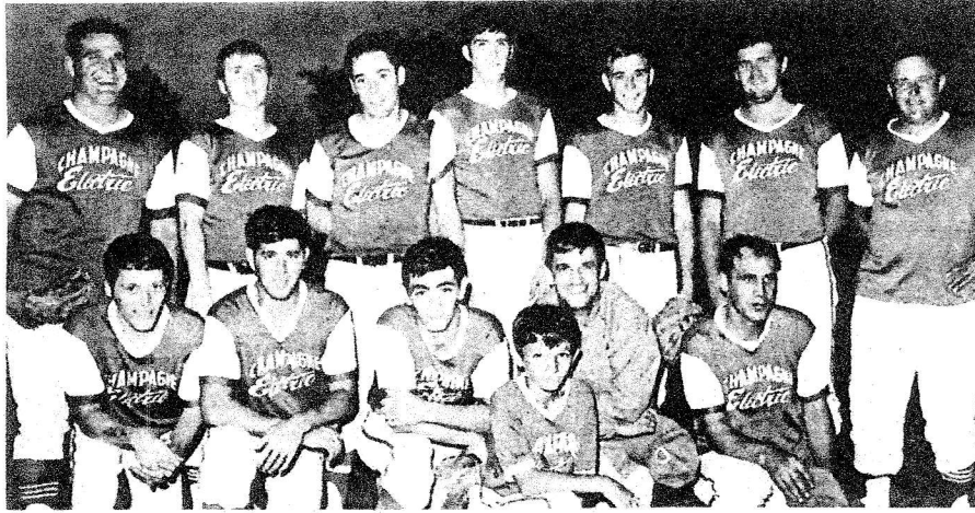
1969 TEAM - CHAMPAGNE ELECTRIC