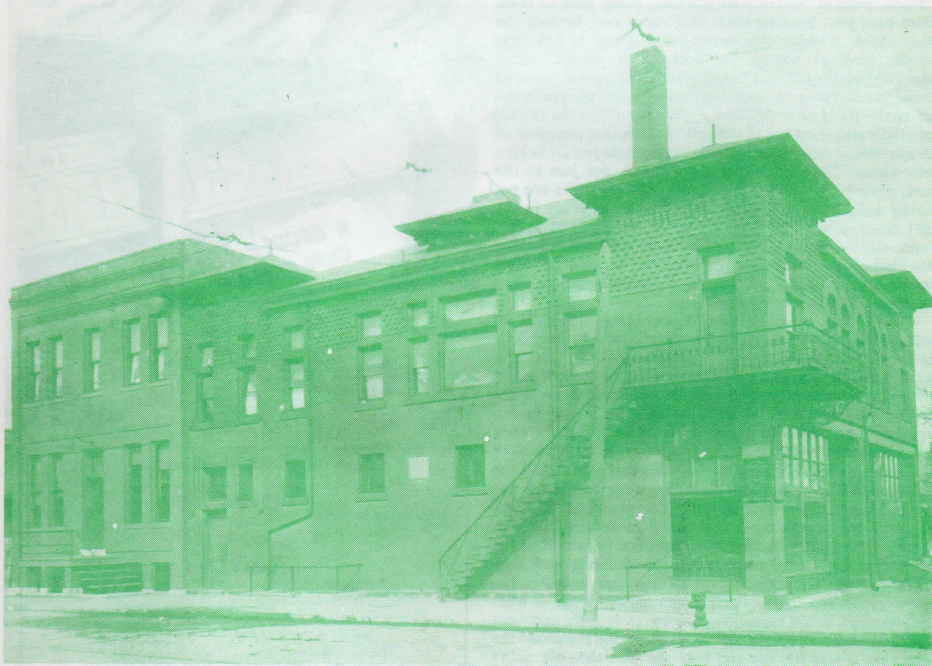
1898 Bethel Healing Home — 4th and Jackson Sts. — Topeka, Kansas