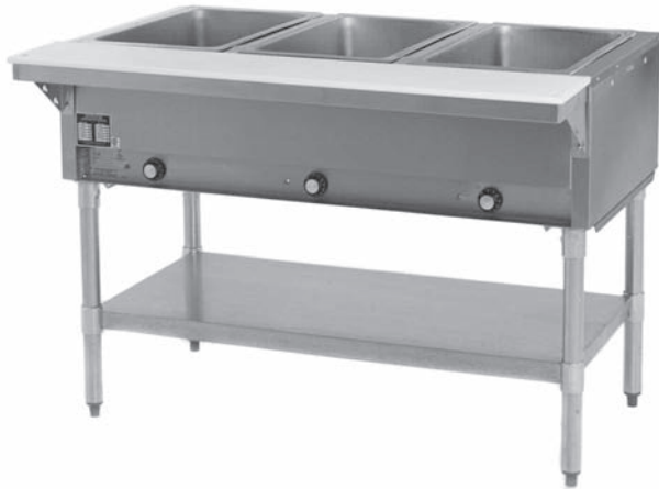
#DHT3-120 hot food table

Eagle Hot Food Tables, open base design, model _____ . Top and body to be heavy gauge type 430 stainless steel. Beaded top openings to be 12 3/32" x 20 3/32". Heating compartments to be 8"-deep, galvanized, and insulated on all four sides and bottom with 1" fiberglass or equal. Recessed control panel, with individual infinite controls, offer high and low settings. Each compartment fitted with 500-watt heating element for 120-volt units, and 750-watt heating element for 240-volt units. Six foot cord and plug extends from the bottom right hand side of the unit (not available on 208V/240V 3-phase units). Furnish with polycarbonate cutting board. Legs to be 1 1/2" O.D. tubing, with adjustable undershelf and adjustable bullet feet.