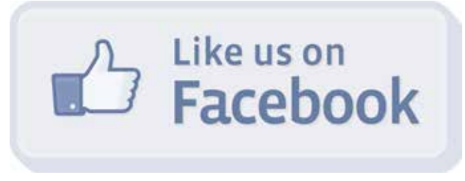
Gardens of Gulf Cove POA

Rather than getting your feathers ruffled, make simple accommodations to avoid wildlife conflicts then relax and enjoy the wonders of wildlife in your own backyard.