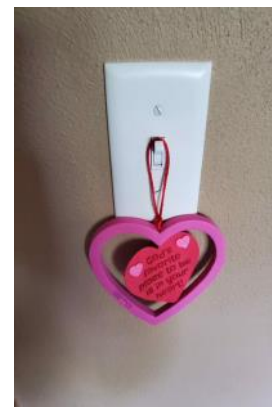
Sunday School Valentine’s Art Projects