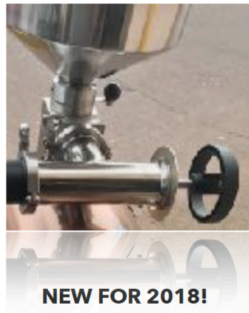
NEW FOR 2018! MDDS AIRFLOW SYSTEM FOR PRECISE AIRFLOW