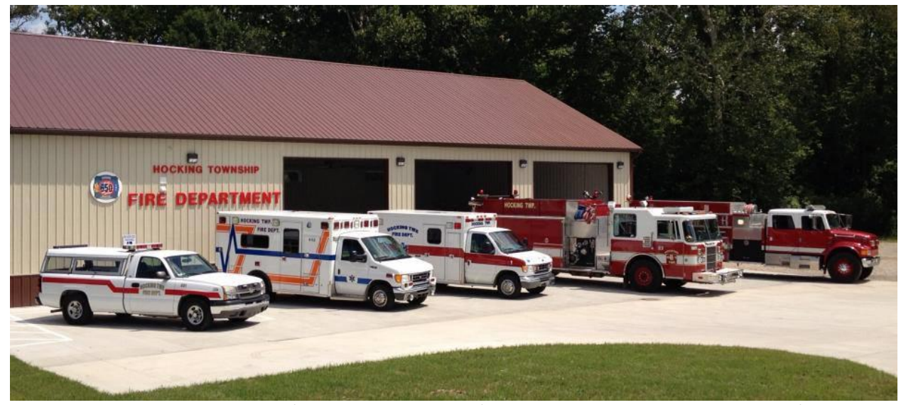
Grass 651 Medic/Squad 652 Medic/Squad 651 Engine 651 Engine/Tanker 652