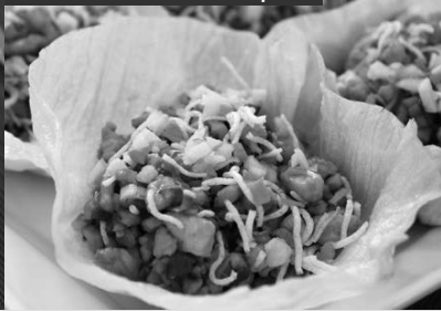
Chicken Lettuce Wrap