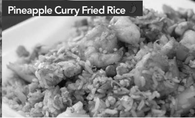
Pineapple Curry Fried Rice