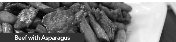
Beef with Asparagus