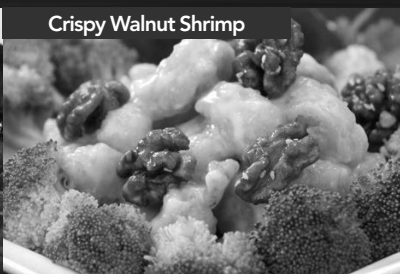
Crispy Walnut Shrimp