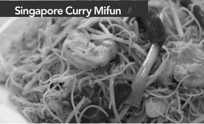
Singapore Curry Mifun