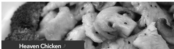
Heaven Chicken 🍗