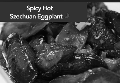
Spicy Hot Szechuan Eggplant 🍤