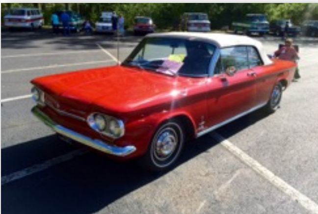
Al Birks' 1963 Spyder convertible - Silver award