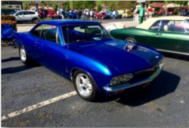
Gary Greenwood's 1965 Monza coupe - Gold award